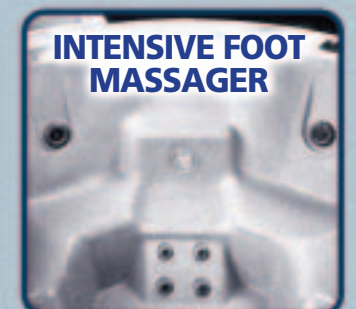
INTENSIVE FOOT MASSAGER